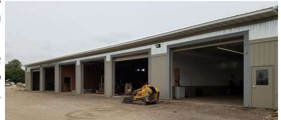
Our Rebuild Complete!

We are more equipped than ever to serve our customers as we work with nature to create and maintain the beautiful outdoors.